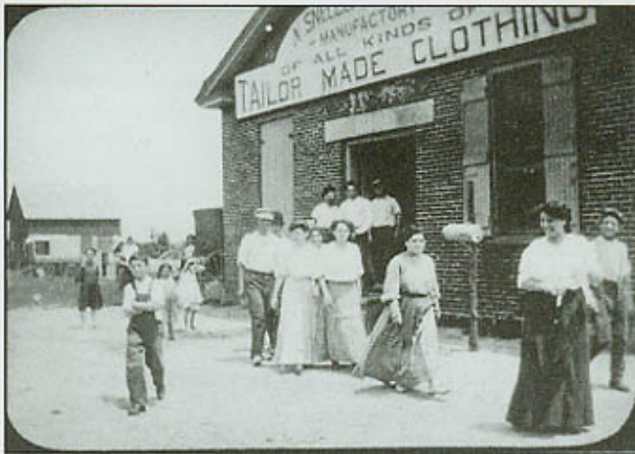
Workers Leaving the N. Snellenberg Garment Factory.