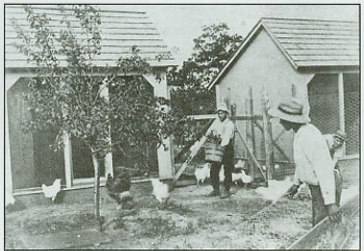
Woodbine Poultry Farmers.