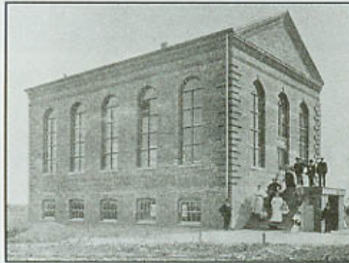
Woodbine Brotherhood Synagogue circa 1896.

The collection of historical photos acquired through research done for the opening of the Museum is now posted on the Museum's website under exhibits . The collection is designed by categories and sub-categories commemorating the founders of Woodbine, Woodbine's daily activities, and Woodbine architecture. We have permanently posted the photographs for your viewing