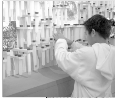
A Woodbine Elementary School student adds his memories to the Wall.