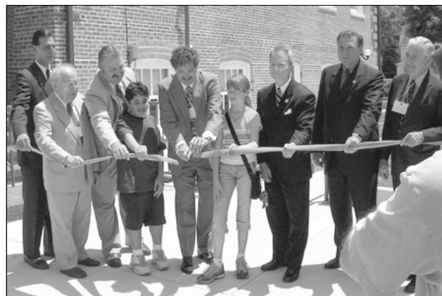
Ribbon cutting ceremony